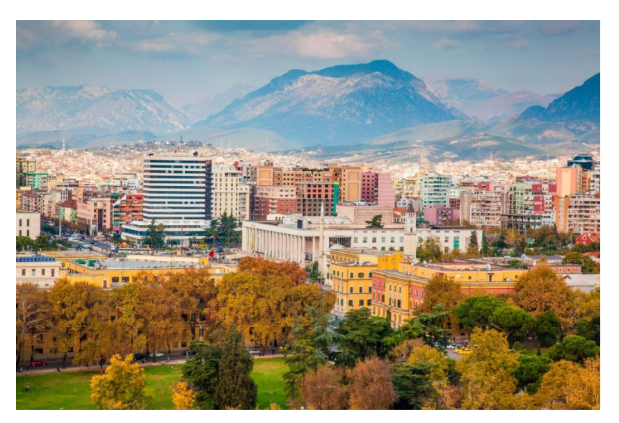
Tirana with Dajti Mountains

Tirana International Airport (Mother Teresa Airport - TIA) is about 11 miles from Tirana city center. If you want to arrive early or stay late, accommodations can be arranged through Cycle Albania.